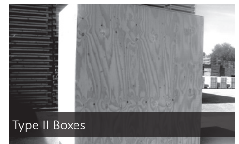
Type II Boxes